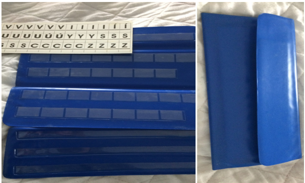
Vocabulary spelling and practice.